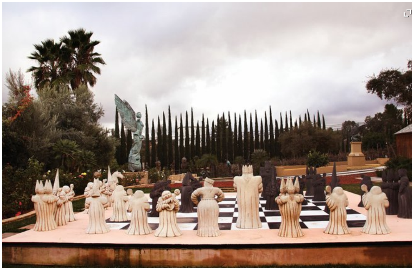
Rashelica Winery & Art Garden